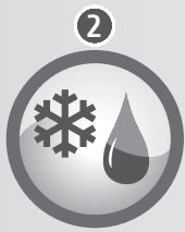
Water & Snow Resistance