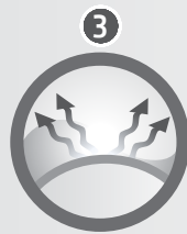
Water Vapor Escapes