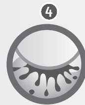
Blocks Ground Moisture