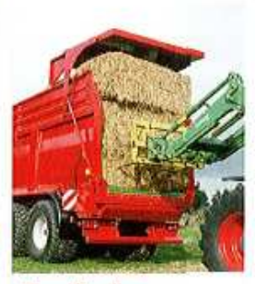
Einer für alles.