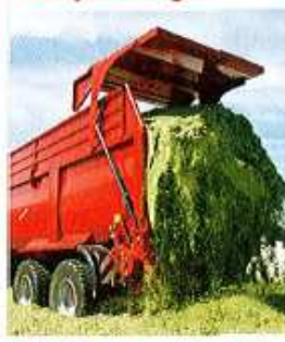
NEU: Jetzt auch in ALU!