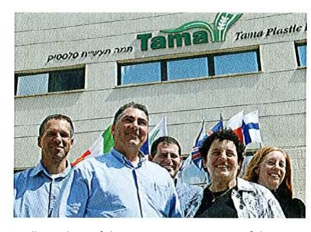
All members of the management are part of the Kibbutz community und therefore owner of Tama.

Today Tama, which is the name of the company, is world market leader with net for round bales. The 1100 employees were generating revenue of 242 million Euro in 2011. The growth was about 30% last year.