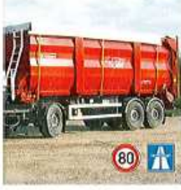
NEU; Jetzt auch mit Drehschemel oder als Sattelauflieger.

Telefon: 0 25 41 / 80 178-0 www.krampe.de