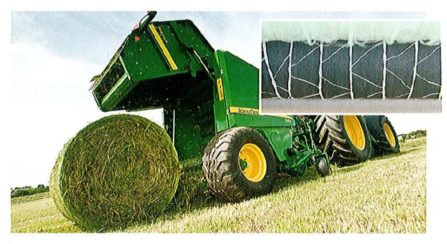
The Schuss-threads of the Tama nets are waved and therefore elastic. Because of this the net does not run in when running on the bale and also the shoulders are covered.

Tama is world market leader with round bale net and to their