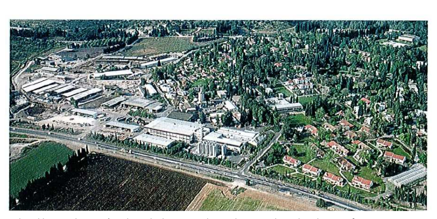
The Kibbutz Mishmar Ha'Emek was built in 1922. The residents mainly work in the Tama factory or in agriculture.

There is a big bustle in the dining hall around noon time. Some women dish out the lunch - several dishes to choose. They are cooking for everyone for every meal. Today everyone is throwing a voting paper in a specially placed box. That's because everyone is deciding about new Kibbutz members. A weekly meeting is taking place for new projects and tasks in the Kibbutz and in Tama where also everybody has a voice.