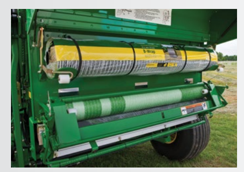
You can switch your baler between netwrap and B-Wrap in less than five minutes.