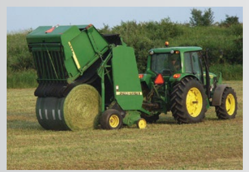
With a simple B-Wrap kit, most newer John Deere balers can apply B-Wrap.