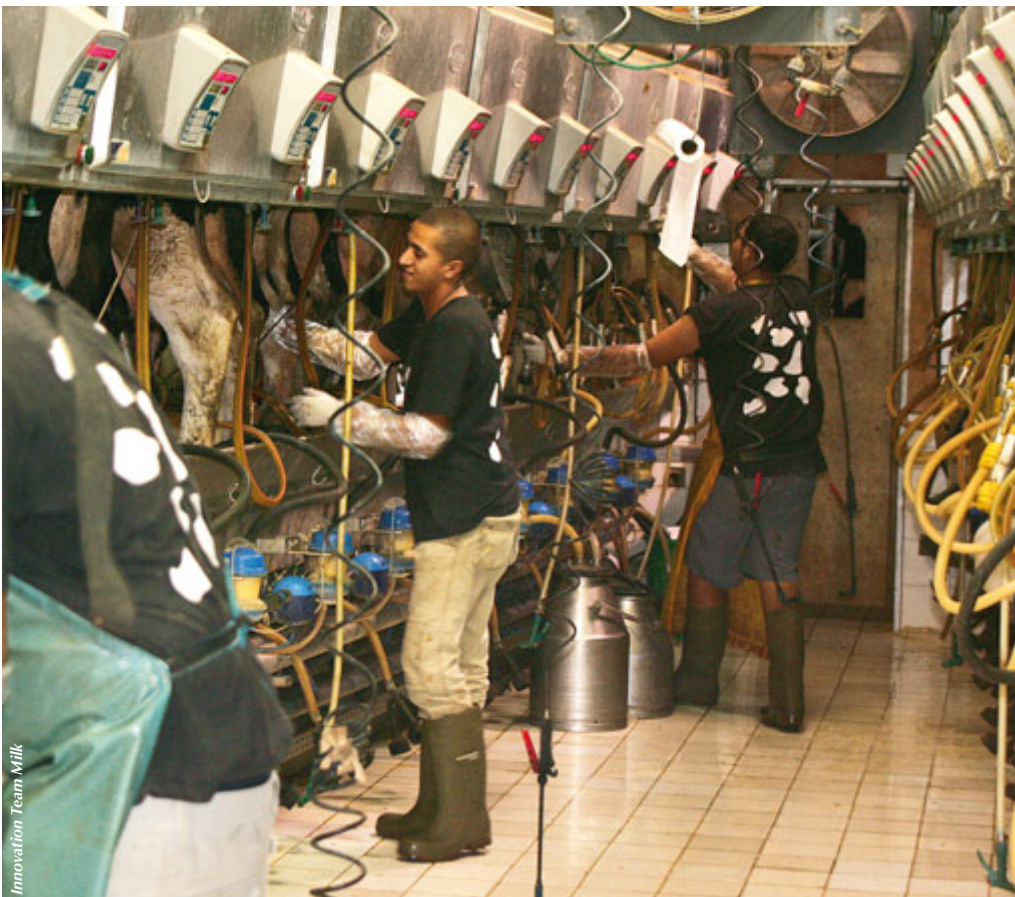
Innovation Team Milk

The past two decades have seen increasing numbers of foreign workers on Israeli farms. Now a quota has been imposed and this work force is being reduced. In den vergangenen zwanzig Jahren wurden vermehrt ausländische Mitarbeiter auf den Betrieben eingestellt. Mittlerweile gibt es eine Ausländerquote. Ces vingt dernières années, les élevages ont de plus en plus fait appel à des salariés étrangers. Ils sont aujourd'hui soumis à des quotas.